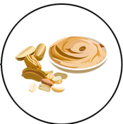
n & s butters